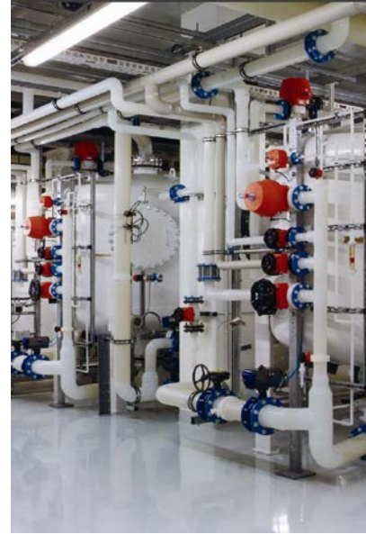
PVDF life science