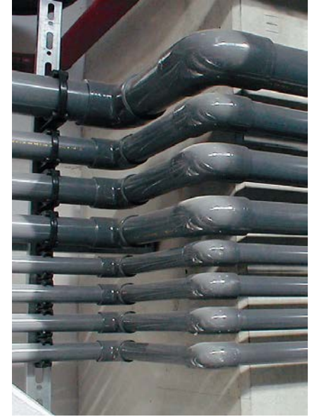
PVC-U chemical industry