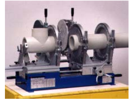
Butt fusion machine