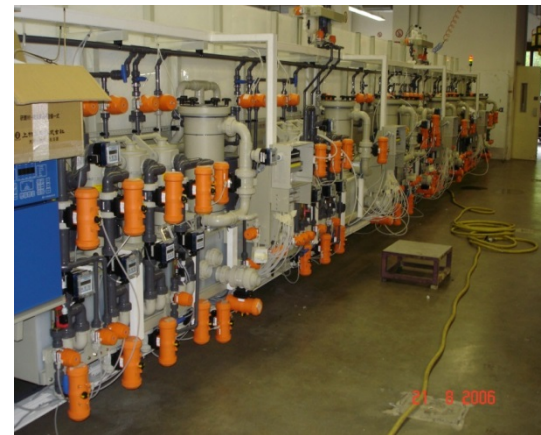
PPH water treatment