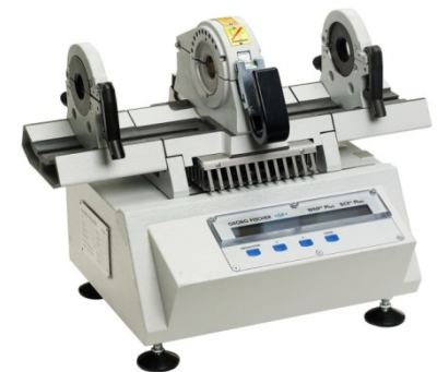
PCF fusion machine