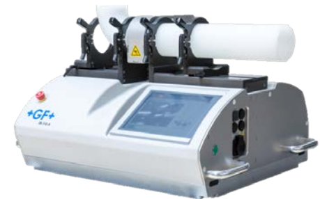
IR fusion machine