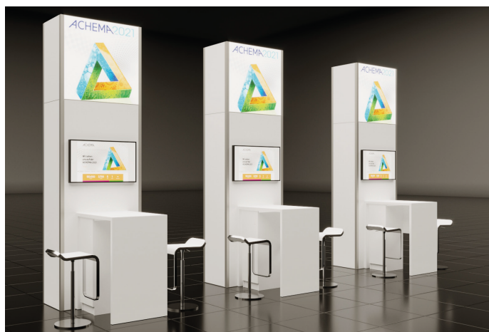
With an attractive stele stand for a professional trade fair appearance in the Digital Innovation Zone.

In Hall 12.1 representatives of the digital industry who you have always wanted to meet at ACHEMA will present themselves. Showcase your company in this newly created, innovative setting and gain perfect access to the digitization activities of the global process industry. Your participation opportunities are multiple: